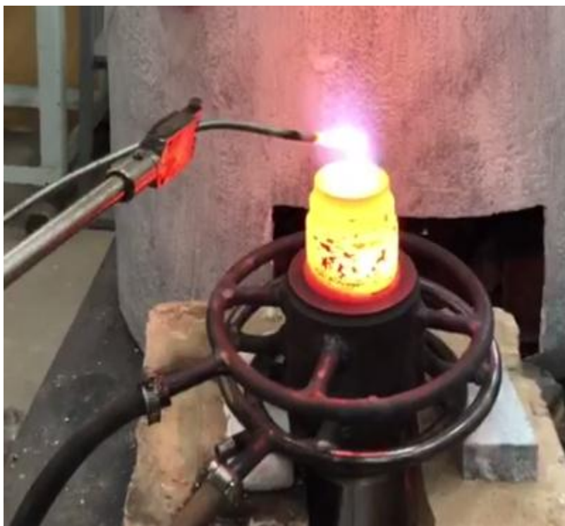
Figure 2. Nozzle with large annular slit b=5\text{mm} , pressure 6 \times 10^5 \text{ Pa} . Vertical Position of flow direction.