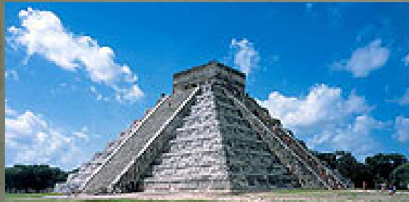
CHICHEN ITZA, MEXICO