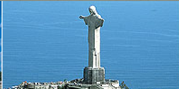
CHRIST REDEEMER, BRASIL