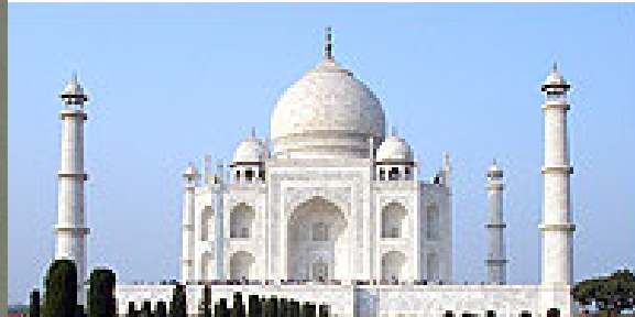
TAJ MAHAL, INDIA