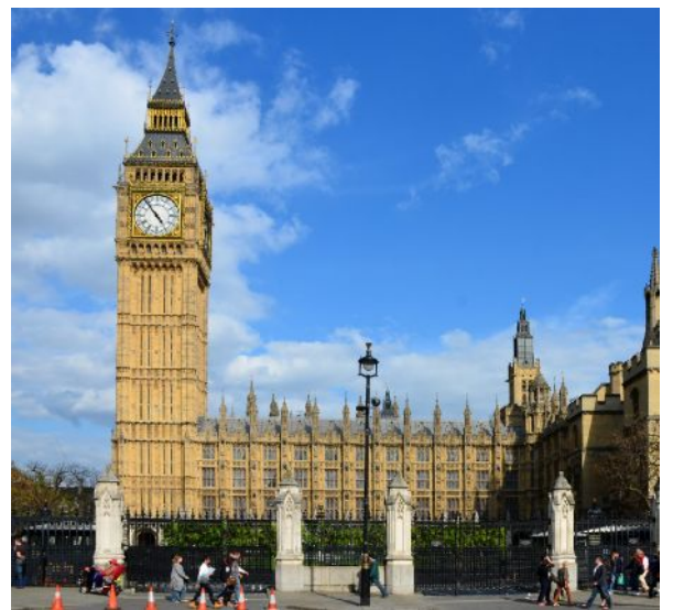
Name of pictures: Trafalgar square, London Bridge, Royal family, Big Ben