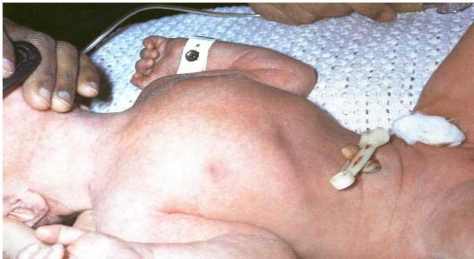
Fig. 1. Exterior false patient with congenital diaphragmatic hernia

Most children with false diaphragmatic hernias respiratory and cardiovascular disorders occur immediately or in the first hours after birth and are pronounced. Most often occur cyanosis and dyspnea, which are manifested in the form of attacks. This condition is called "asfiksicheskim infringement", stressing that the front act symptoms of acute respiratory and cardiovascular disease, whereas symptoms of bowel obstruction not have time to develop as the child undergoes surgery or die early from cardiopulmonary failure. On examination, in addition to cyanosis, may draw the attention of the asymmetry of the chest with bulging on the affected side. Respiratory excursion of the half chest sharply reduced. Respiration is rapid, superficial. Stomach due to move into the chest cavity organs, usually sunken, scaphoid (Fig. 1). Percussion over the corresponding half chest determined tympanitis, auscultation-a sharp weakening of breath.