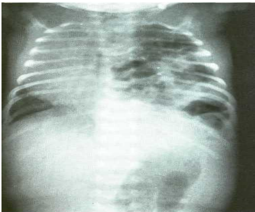
Fig. 2. Survey radiograph of a child with congenital left-sided diaphragmatic hernia. In children, the first days of life, it is usually difficult to identify the border of the collapsed lung on the affected side.

After birth, the main method of diagnosis is radiography. The survey includes an overview of chest radiography and, according to testimony, radiopaque research methods, the nature of which depends on the type of alleged pathology. At the Review radiography for false diaphragmatic hernia, pleural characterized by annular or cellular enlightenment throughout the affected side of the chest (Fig. 2).