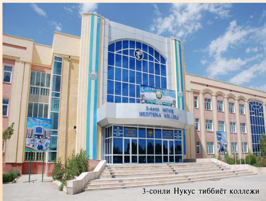
3-сонли Нукус тиббиёт коллежи

Educational establishments of a new type, such as professional colleges, lyceums, business schools and academic lyceums are intensively being created.