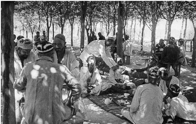
Figure 2. A traditional teahouse as a place of leisure of the male population of Mahalla (1950 years).

August 30, 2001 the Oliy Majlis adopted the law of the Republic of Uzbekistan "On protection, preservation and use of objects of cultural heritage." Within the framework of this law regulates all matters for their conservation, restoration, preservation and use of monuments of material culture. Along with the architectural monuments there is a unique historical environment which forms the residential traditional type homes, streets, so typical of the old city, canals, tea house, landscape elements and others. Over the years, did not attach much importance to the preservation of the c surrounding the monuments that it contributed to a gradual reduction, and in some cases even disappear.