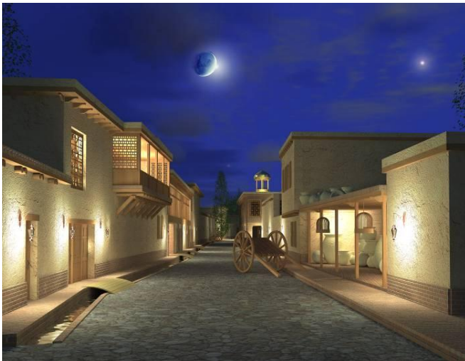
Figure 4. Project proposals for the rehabilitation of facilities located on the street. Zarkaynar Tashkent

To participate in the program were involved in architects, historians, urban planners and archaeologists, members of research institutes, professors and graduate students of Architecture and Construction Institute. The program has been developed the basic concept for the rehabilitation and preservation of the Old City, and the basic directions of activity and developed drafts project proposals according to the areas, including the streets Zarkaynar and Gulbozor. Buildings of historical streets of residential buildings takes into account the nature of the environment, for these reasons, residential homes project proposals are designed to preserve the historical site appearance using traditional planning and decorating elements in houses not exceeding 2 floors, with the use of modern materials and advanced engineering, transport and social infrastructure. Here is just a program for the phased move of indigenous people in the finished house has been offered.