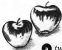
a two apples